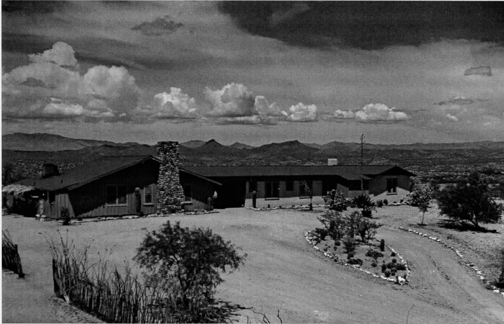
Ranch house of the modern era. Triangle W Ranch, ca. 1960.

Cattle Ranching in Arizona, 1848-1950 Name of Multiple Property Listing =====