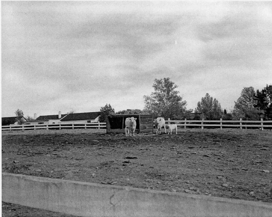
Cattle ranch ca. 1960. Arizona State Library, Archives and Public Records, Archives Division, Phoenix #02-9282.

Cattle Ranching in Arizona, 1945-1970 Name of Multiple Property Listing