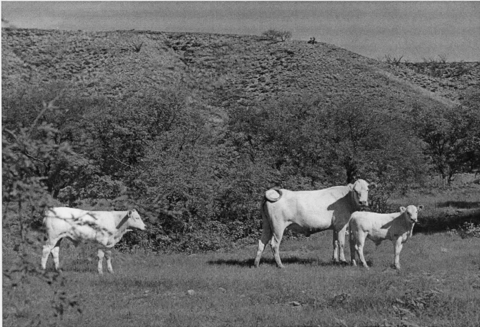
Charolais cattle, ca. 1980.

Cattle Ranching in Arizona, 1945-1970 Name of Multiple Property Listing