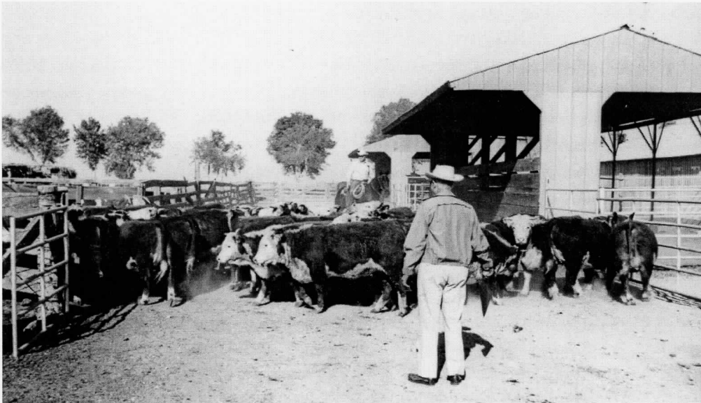
Cattle Feedlot, ca. 1960.

Cattle Ranching in Arizona, 1848-1950 Name of Multiple Property Listing =====