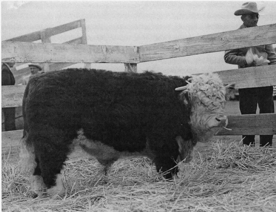
Hereford bull, ca. 1950.

Cattle Ranching in Arizona, 1945-1970 Name of Multiple Property Listing