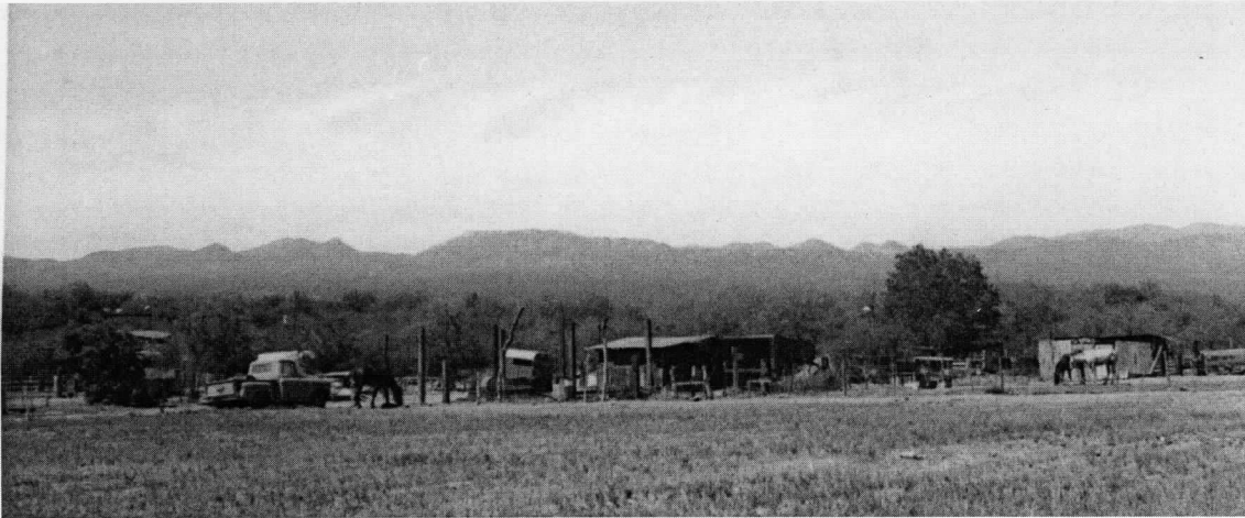
Ranch near Winkleman, ca. 1950. Arizona State Library, Archives and Public Records, Archives Division, Phoenix #02-4502.

Cattle Ranching in Arizona, 1945-1970 Name of Multiple Property Listing