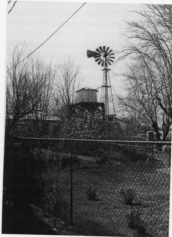
Windmill and water tank on a ranch near Mammoth, ca. 1950.

120 sections of land. Its managing partner, W.R. "Budd" Thurber, was a native Arizonan who had grown up on a ranch just to the east. The investors purchased a registered Hereford herd to upgrade the existing 1,000 head of cattle and invested in new, large stock buildings. While its vast extent might seem able to support innumerable cattle, in reality the herd's survival depended upon 750 acres under pump irrigation to raise feed crops and alfalfa. 29 Large capital investment in equipment and stock of the type exemplified by the Sopori Ranch were to characterize successful ranching in the coming decades.