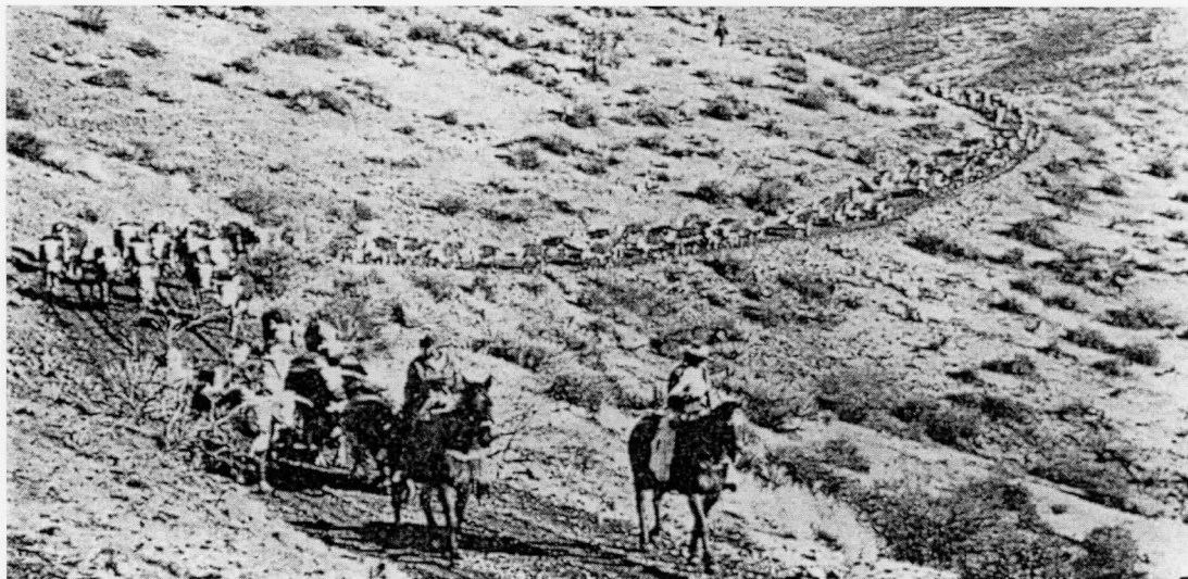
Trail drive of the San Carlos Apache Tribal herd along Yellowjacket Trail. Western author Stella Hughes, right foreground, Arizona Cattlelog , April 1965, p. 30.

Cattle Ranching in Arizona, 1945-1970 Name of Multiple Property Listing