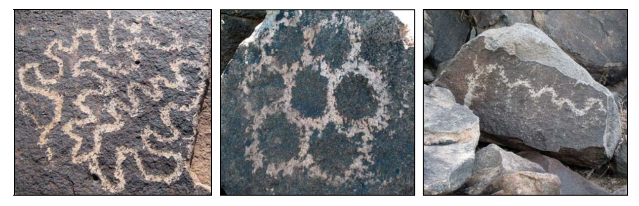
Figure 3. The meandering line petroglyph on the left is a common design from the Archaic Period. O'odham consultants say the cluster of circles in the middle image may represent a cactus flower, while the petroglyph on the right represents a snake. Snakes, lizards, animals, crosses and lightning are familiar designs to the O'odham.

Ferg, Alan, 1979, The Petroglyphs of Tumamoc Hill, The Kiva, vol. 45, Nos 1-2, pp. 95-118.