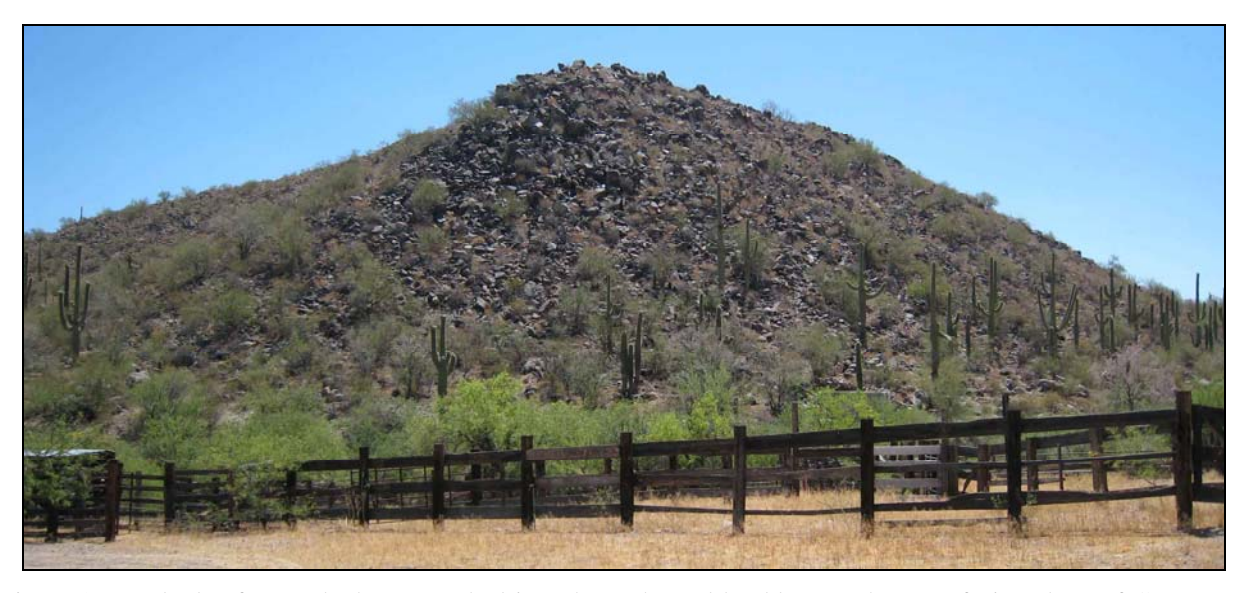
Figure 1. Hundreds of petroglyphs are pecked into the rocks and boulders on the west facing slope of Cocoraque Butte.

On both trips, the Tohono O'odham delegations climbed to the top of the western peak of Cocoraque Butte, examining hundreds of petroglyphs pecked into the dark brown boulders and rocks found on the steep escarpment of the butte (Figure 1).