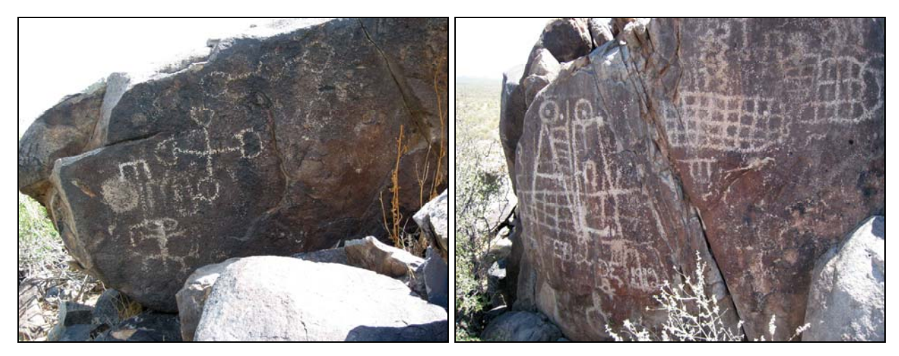
Figure 2. Geometric and reticulate designs on Cocoraque Butte are signs of Huhugam history connecting the Tohono O'odham with their ancient ancestors.

O'odham cultural landscape. The rock images found on Cocoraque Butte provide excellent examples of the Hohokam petroglyphs found in southern Arizona.