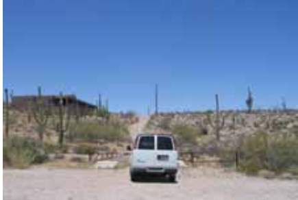
Trailhead parking for South Belmont Trail

South Belmont Access Go southwest on Abington Road off Belmont Road about 0.6 mile. On your right will be a pullout area, a gated dirt road, and a trail sign by Pima County Natural Resources Parks and Recreation. Park here, walk .11 mile up hill to Park Access Point. This is the southern end of the Belmont Trail.