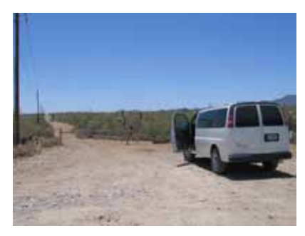
Parking for the north Belmont Trailhead.

Go west about 1.2 miles on Belmont Road off Silverbell Road. You will see a gated road on your left. Park in the area in front of the gate. This gated road is the access road along the natural gas pipeline and power lines, and is the Belmont Trail.