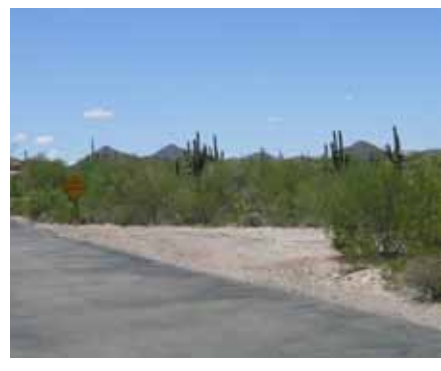
Parking for the Abington Road Trailhead. 32°18.685'N 111°05.790'W

Go southwest on Abington Road. Past the South Belmont Trailhead (#2) at about 1.1 miles you will see a small turnout on your right with a"no outlet" sign. Park here, walk up the road about 0.2 mile to the Park Access and trailhead.