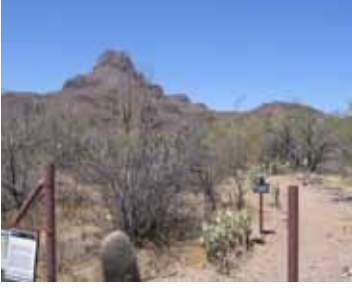
Park Access Point (Trailhead). Safford Peak is in the background.